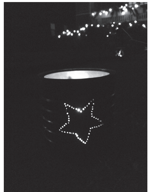
Luminaries light up the Astor Neighborhood.