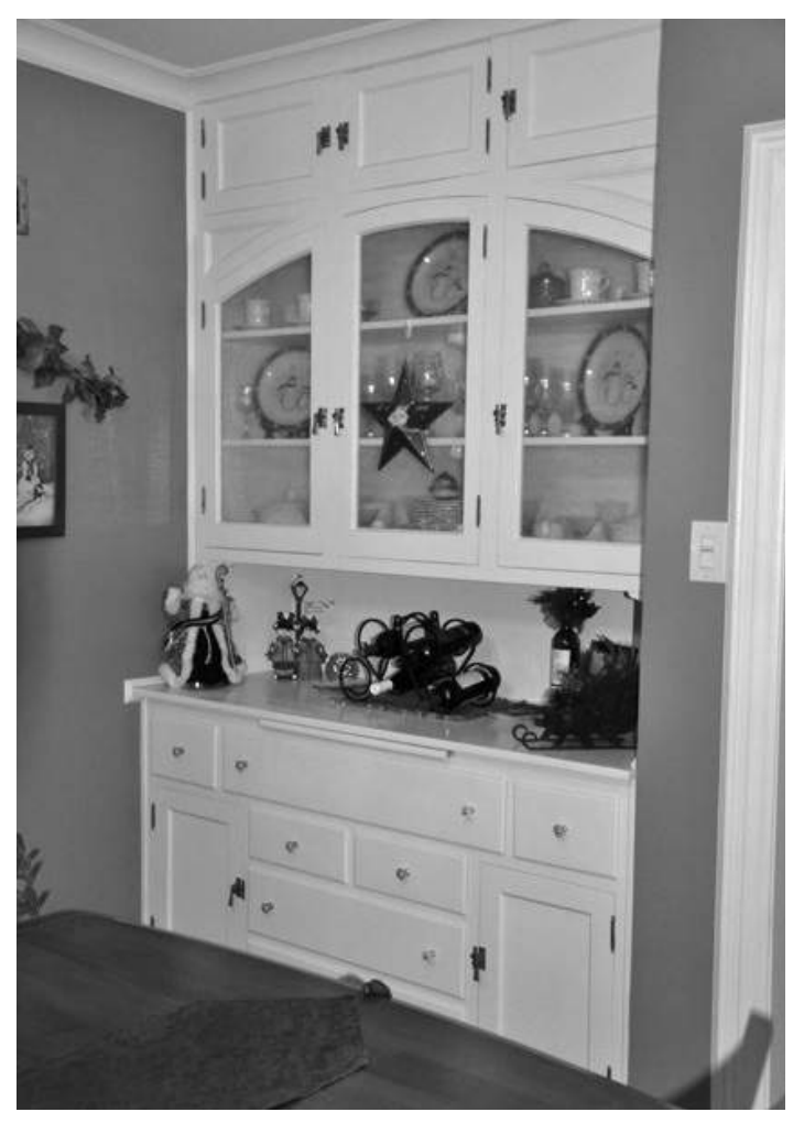
Original kitchen hutch in its new location.

Thank You to Seaway Printing Company for the donation of this newsletter.