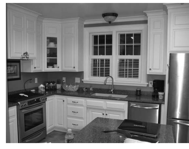
New kitchen with work island.

Their major indoor project has been a complete kitchen renovation. They actually did the demolition work before they had finalized their plans for the rebuild so that they could better visualize the space. In order to make room for a work island, an area, which had included two closets and a breakfast nook next to a beautiful built-in hutch with original