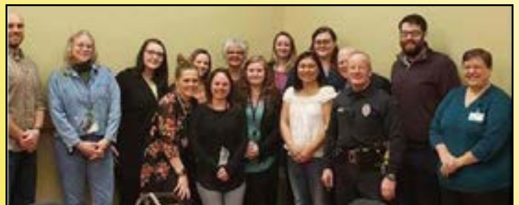
The Homeless Outreach Team