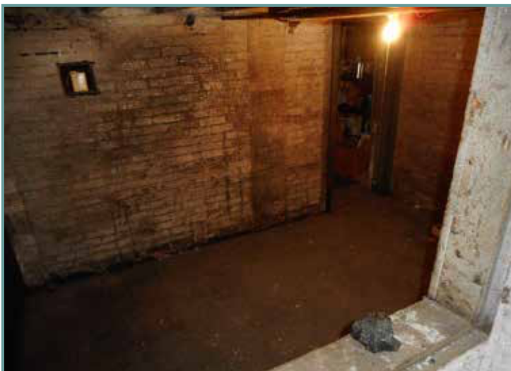
A coal room in the basement of an 1881 Queen Anne

a slotted channel that would allow for boards to be inserted to build up a temporary wall is typical for a coal room. Nobody wanted to open the door to their coal storage room and end up with an avalanche of coal pouring into the rest of the basement.