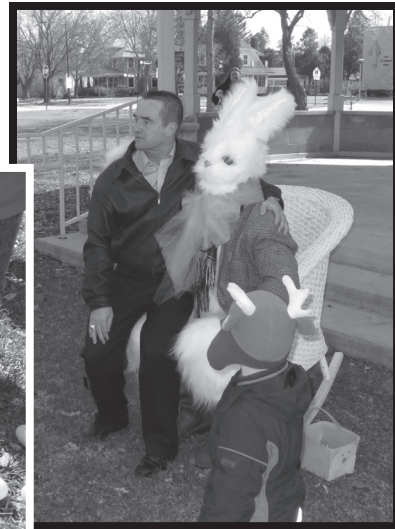
The mayor and the Easter Bunny pose for a picture.