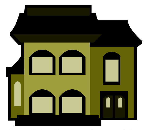
House Kudos: If you know of someone in the neighborhood who has worked hard at fixing, improving, or updating a home, please call or e-mail any board member for some <u>Astor Outlook</u> House Kudos

Congratulations to Altrusa on providing a beautiful home to those in need and those cared for by our health care neighbors in the Astor Neighborhood.