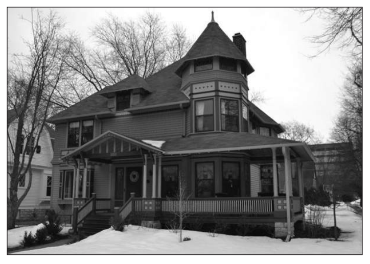
The multi-colored palette utilizes light and dark colors juxtaposed to accent architectural features.

exterior screens concealing the porch columns. Andrew recalled growing up on the east coast and spending summer vacations in Cape May, NJ, a historic beach town heavily populated by turn-ofthe-century multi-toned, "painted lady" Queen Anne Victorians. These historically appropriate painted homes served as their inspiration for this project.