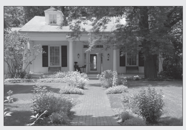
The multi-colored palette utilizes light and dark colors juxtaposed to accent architectural features.

Join us as we celebrate "Petals & Porcelain" June 7th to 9th from noon until 4 pm each day. Admission is $7.00. Bring in your newsletter for an additional $1.00 off. Hazelwood is located at 1008 S. Monroe Avenue. For additional information bchs@netnet.net or 437-1840