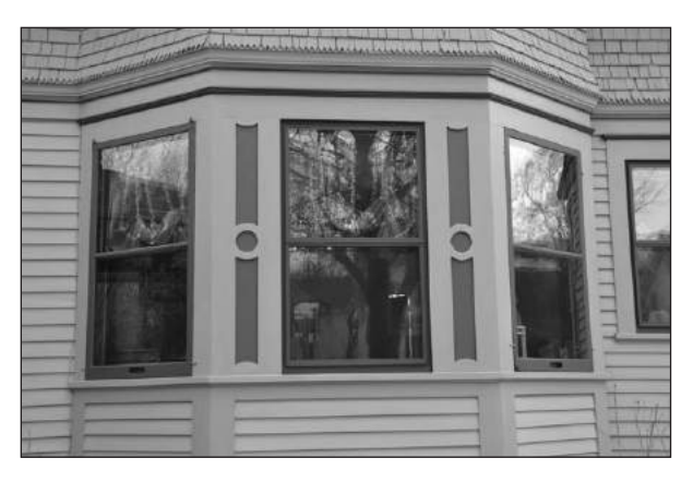
The circular accents next to the windows were custom made to replace diamond shapes that were present when the Higgins family bought the house; they later discovered that these shapes were what existed on the original house.

The typical Queen Anne Victorian turn-of-thecentury color palette includes both earth tones and brighter colors that borrow strongly from nature. Whites were not used. The house that they bought had some of its remarkable Victorian features obscured by a monochromatic paint scheme and