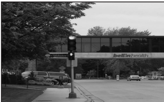
Proposed Logo Location on Cass