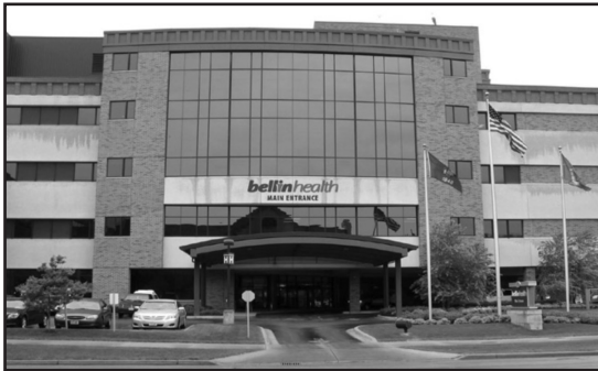
Proposed Logo Location on Webster