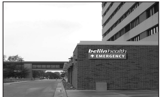
Proposed Logo Location on VanBuren