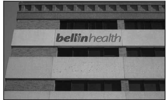
Proposed Logo Location on VanBuren