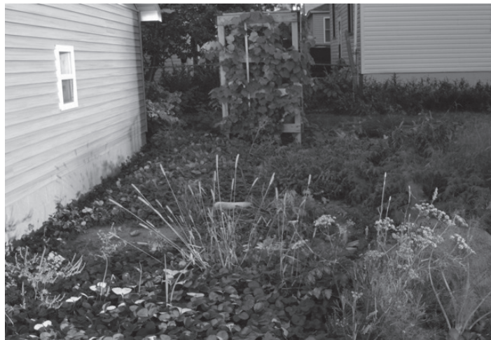
Backyard garden abundant with strawberries, dill, lavender, peppers, tomatoes, grapes, raspberries, and more.

Thank You to Seaway Printing Company for the donation of this newsletter.